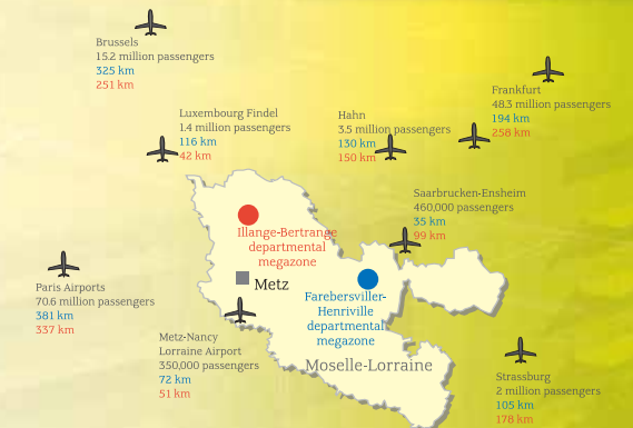
Distance - in km - from the Farébersviller-Henriville megazone to major airports Distance - in km - from the Illange-Bertrange megazone to major airports

Freight can be shipped by Cargolux from Luxembourg-Findel or from Hahn in Germany.